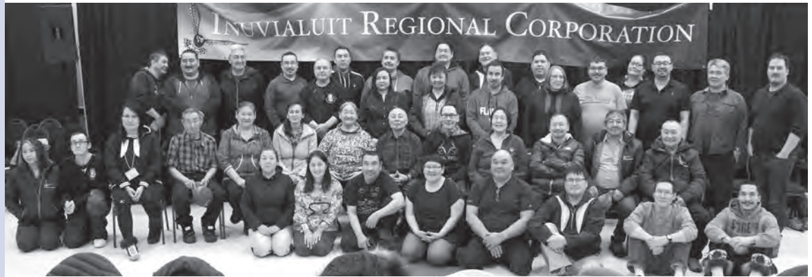
CC Directors from Aklavik, Inuvik, Paulatuk, Sachs Harbour, Tuktoyaktuk, Ulukhaktok.

...with the 42 Directors. Ublumi. Uvlumi. Good day.